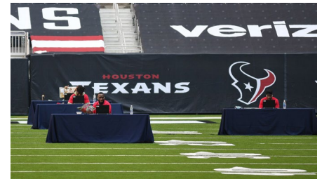
Houston Texans players at NRG preparing to read virtually to HISD students