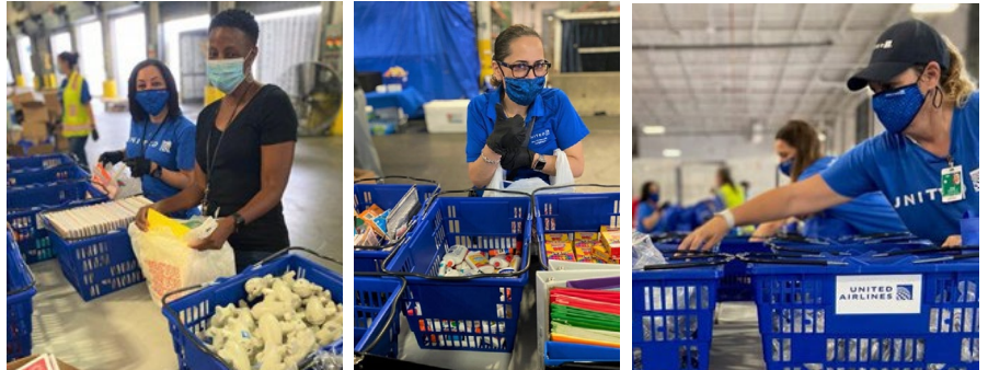
United Airlines Volunteers at the United Airlines Cargo Facilities

United Airlines helps to prepare HISD students to take flight for the 2020-2021 school year by providing them with essential hygiene care packages and school supplies.